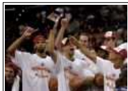
USC vs. Arizona State basketball